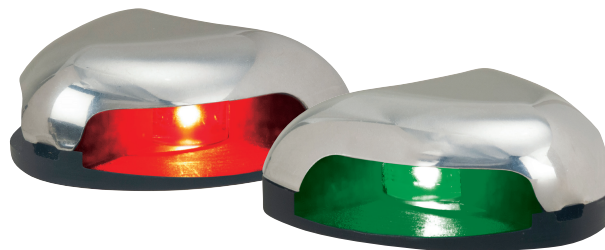
Fig. 0626 Ordering Information