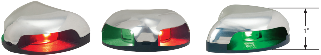
Fig. 0625 Ordering Information