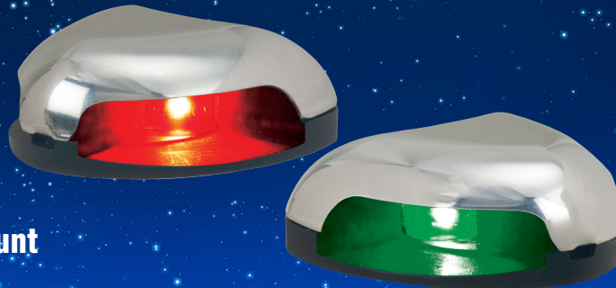
Fig. 0626 Horizontal Mount Side Lights